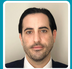
Dr Theo Theodoros

View the full program and register at www.pahsymposium.com.au