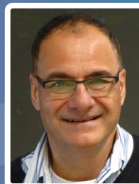
Professor Steve Kisely

Panel discussion: Suicide research and implementation of the zero suicide framework—a case study in suicide prevention